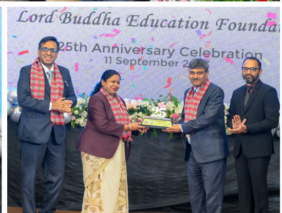
Cord Buddha Education F