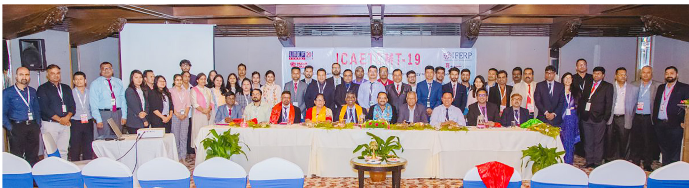
Delegates of 1st ICAETCMT-2019 on 20 th September 2019