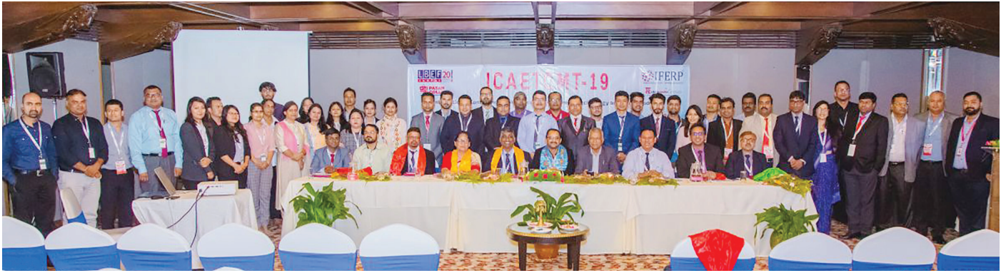
Delegates of 1st ICAETCMT-2019 on 20 th September 2019